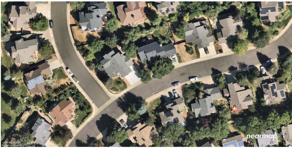
Superior, Colorado, before and after the Marshall Fire, Sept. 11, 2021 and Jan. 2, 2022.

https://wildfiretoday.com/2022/01/05/photos-before-and-after-the-marshall-fire-in-boulder-county-colorado/