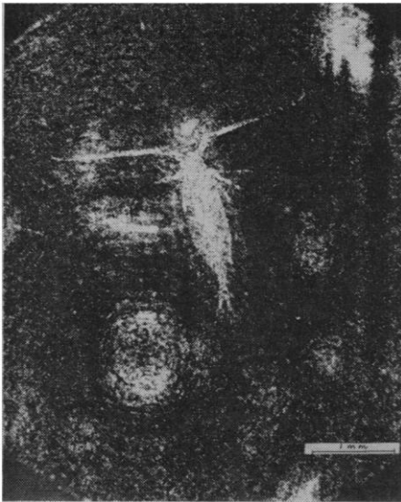
Fig. 2. Photomicrograph from the same hologram used for Fig. 1, showing an organism swimming 11 cm from the hologram plate.