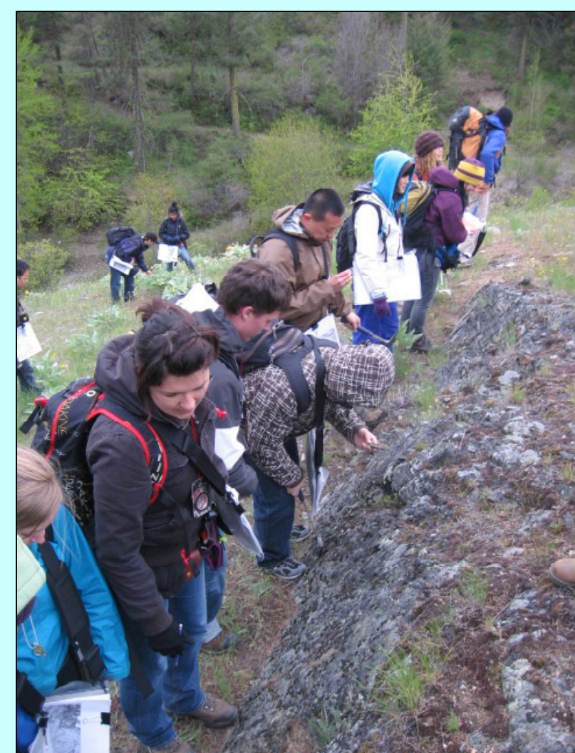
Left: Students examining an outcrop.

2) Observe student in the field to determine degree of expert-like behavior. Are there ways of identifying student behaviors that may indicate early on which students may require additional assistance or specialized mentoring?