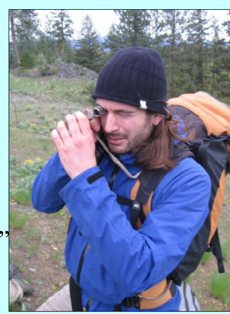
Right: An “expert” mapper in the field.