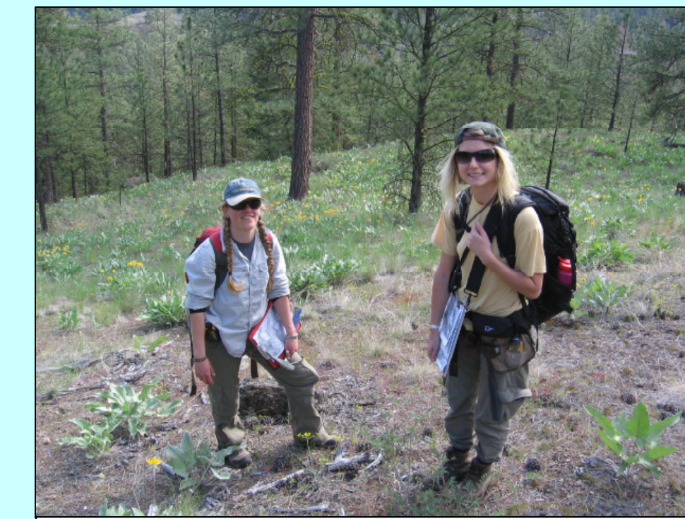
Expert mapping pair.

Despite these qualities, experts were often as challenged by the geology as students were.