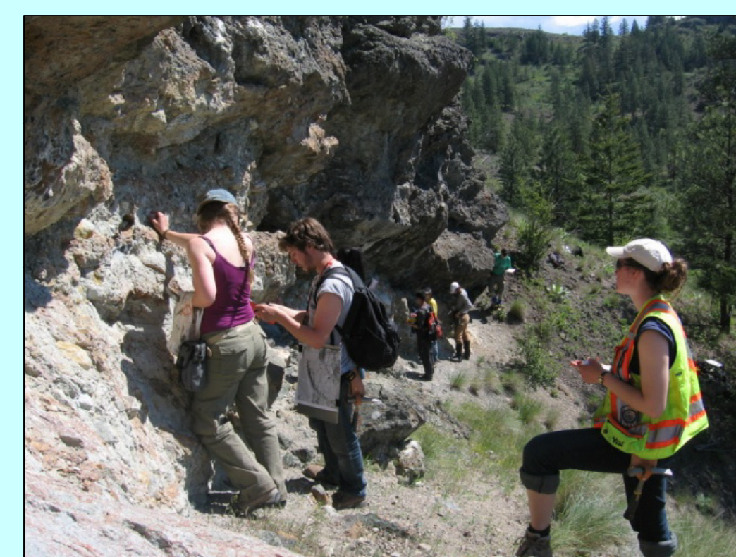
Students mapping in the field.